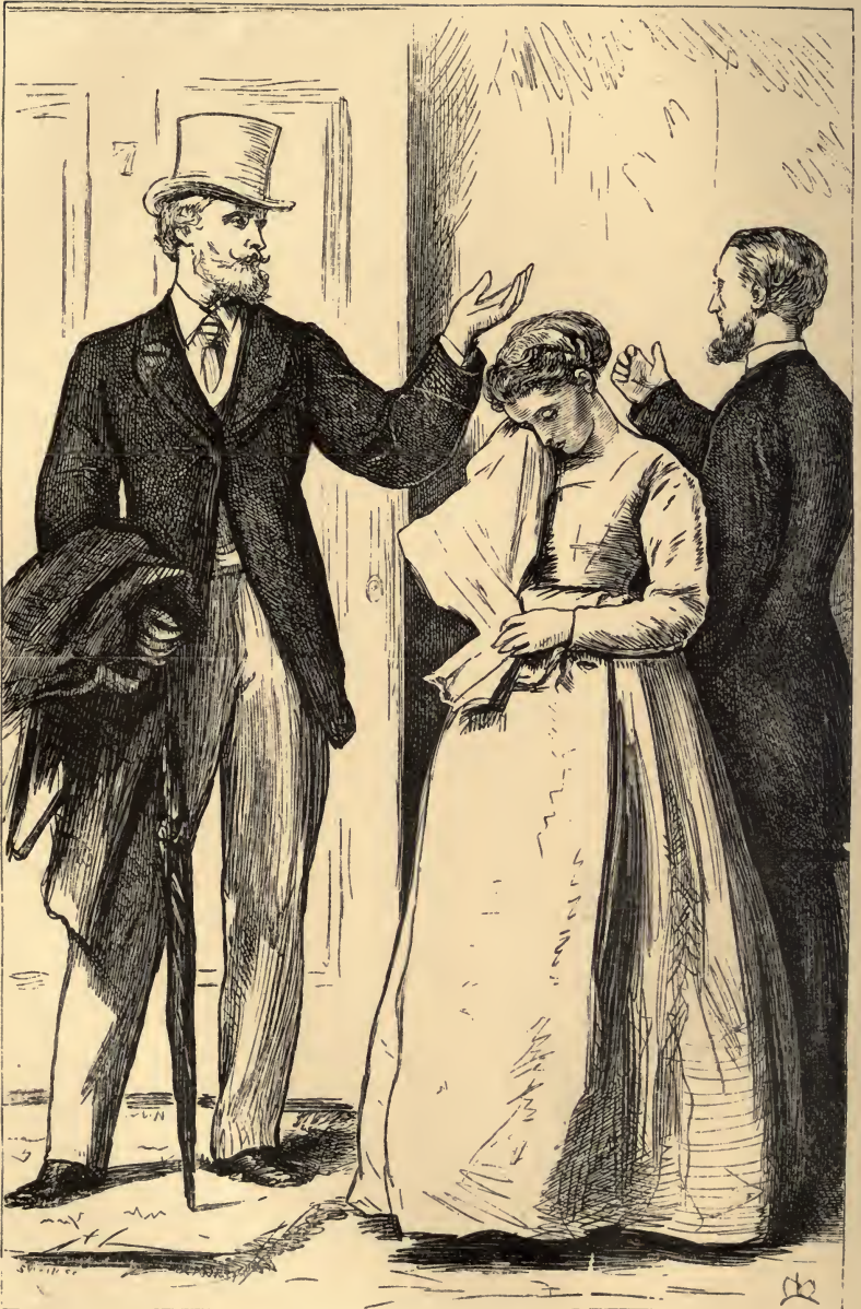
"It's the system as I hates, and not you, Mr. Finn. Well, good-bye, sir."